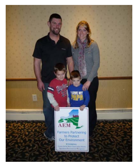
AEM AWARD Co-Vista Holsteins LLC Arcade, NY