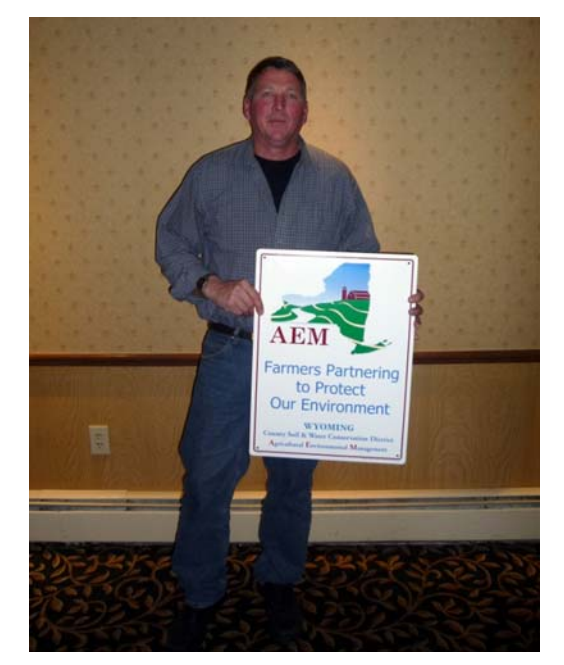
AEM AWARD Harkins Dairy, LLC - Wyoming, NY