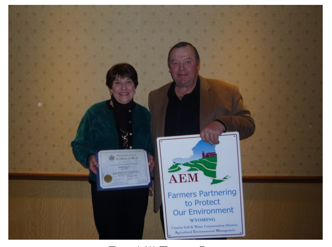
Bowhill Farm, Inc.