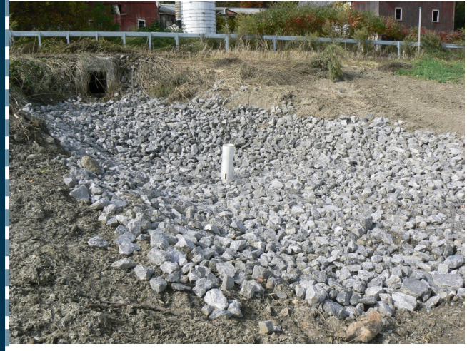
Rock-lined water and sediment control basin with surface inlet at the Jeffres Farm.