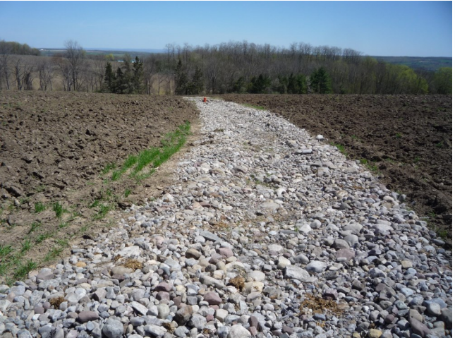
Water and sediment control basin with surface inlet at Harkins Dairy Farm.