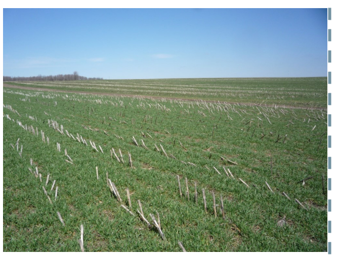
Winter wheat cover crop established after silage corn on the Harkins Dairy Farm.