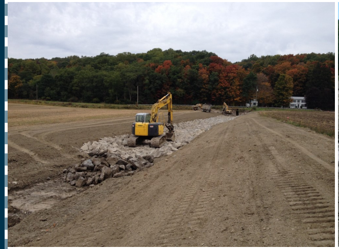
Rock-lined waterway under construction at R. L. Jeffres & Sons Farm.

On the R.L. Jeffres and Sons, Inc. farm in the Town of Middlebury, two large drainage ditches were stabilized with the construction of 533 feet of rock-lined waterways and 1,752 feet of grass waterways along with the construction of a rock-lined water and sediment control basin at the culvert outlet with an 8" underground outlet.