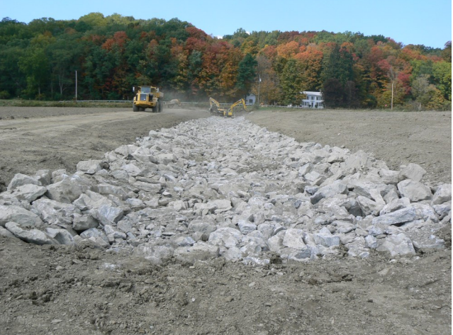
Completed rock-lined waterway at the Jeffres Farm.