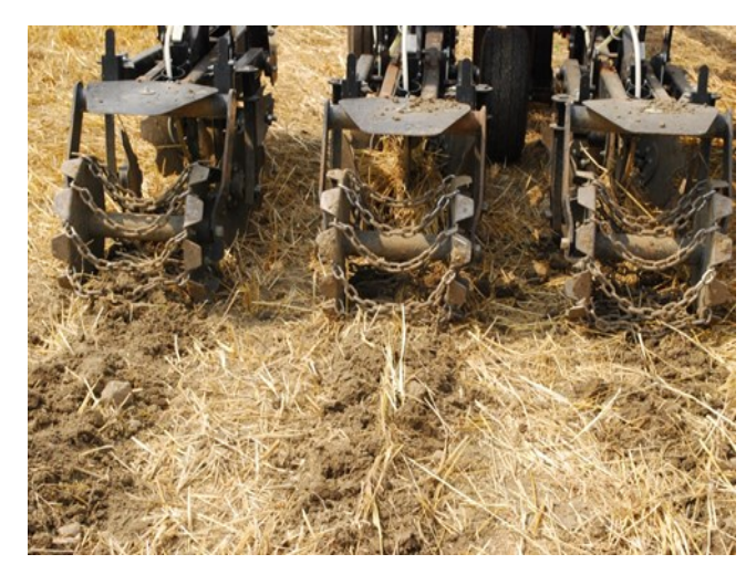
Reduced Tillage Equipment Demonstrations