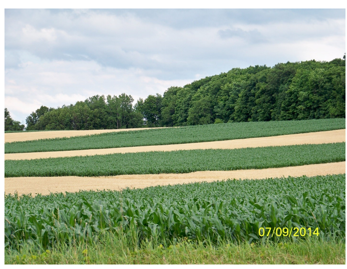
Stripcropping, Genesee County