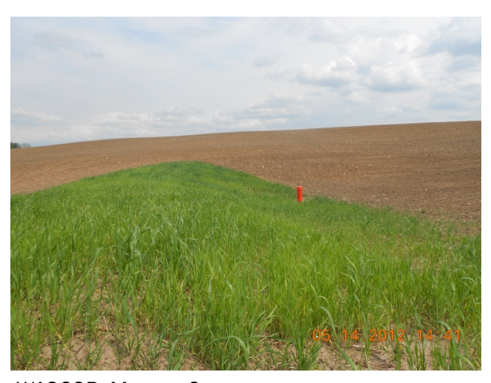
WASCOB, Monroe County