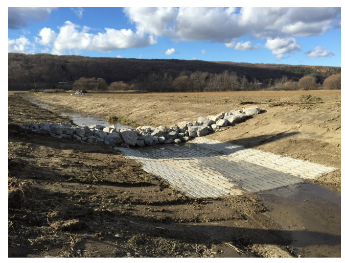
Grade Control Structure, Wyoming County