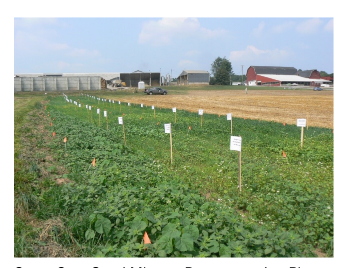
Cover Crop Seed Mixture Demonstration Plots

Over 130 farmers, consultants, and educators from across the region attended. The Field Day focused on live demonstrations of soil health techniques and featured key note speakers Ray Archuleta and Frank Gibbs. Some of the highlights are below!