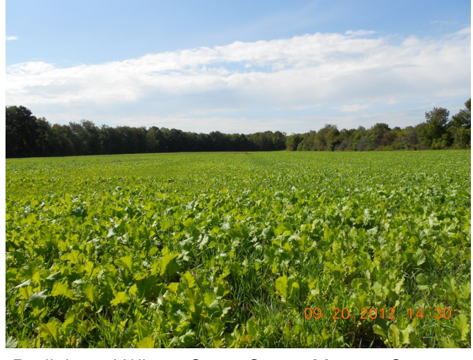
Radish and Wheat Cover Crops, Monroe County