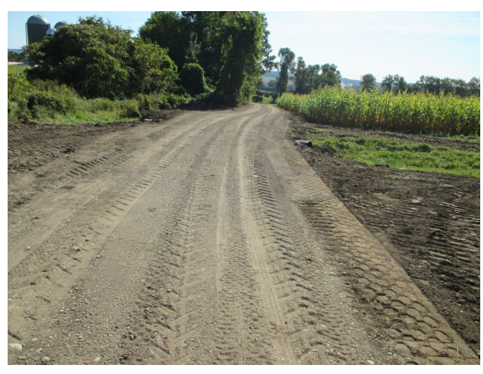
Animal Walkway, Genesee County