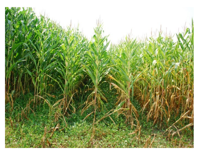
Interseeded Cover Crops