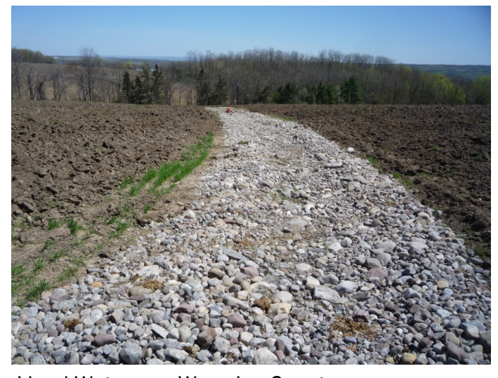
Lined Waterway, Wyoming County