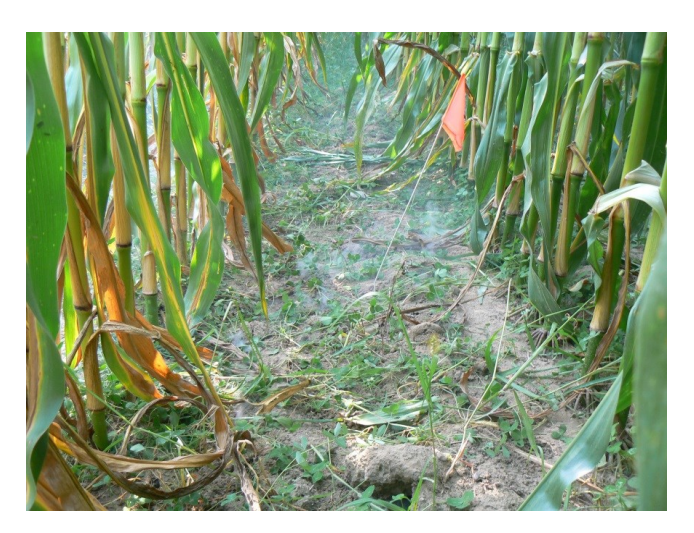
Frank Gibb's Smoke Machine (shows the importance of soil biota to soil structure)