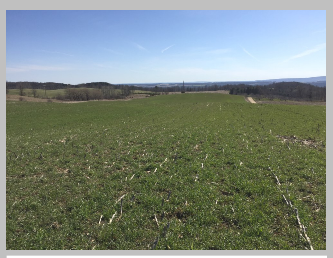
Cover Cropping at Pankow Farms