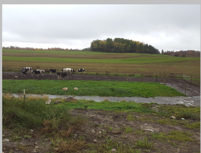
Livestock Exclusion Fencing, Stream Crossings and a Herbaceous Riparian Buffer at Stoney Creek Farm, LLC