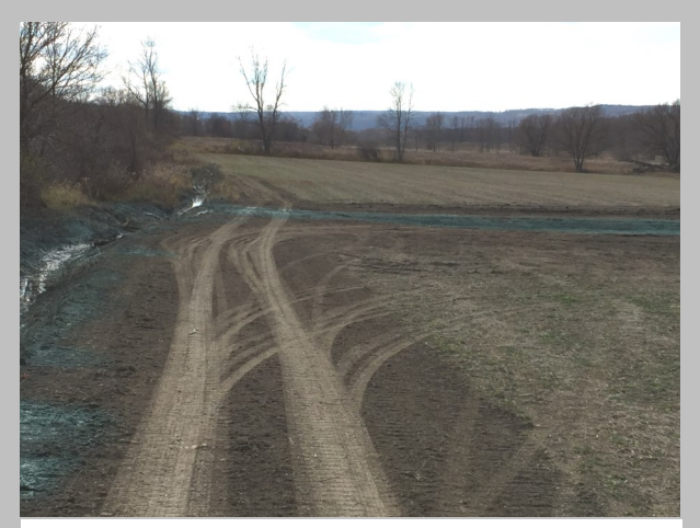
AEM Award - Breezy Acres Farm, Warsaw, NY