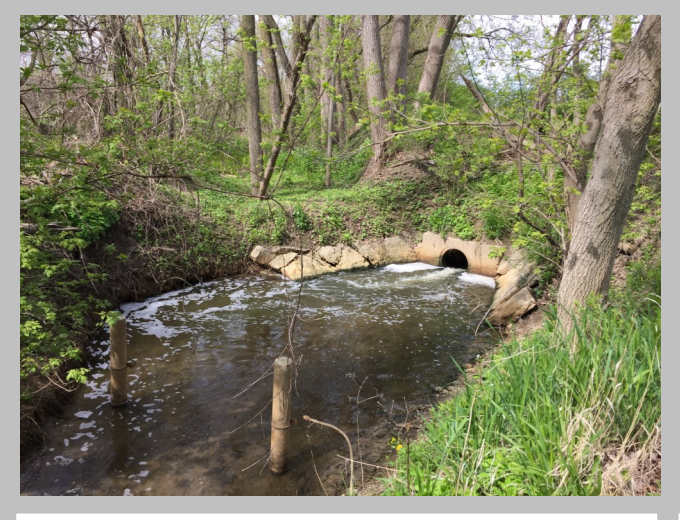
Attica WWTP Stream Stabilization - Before