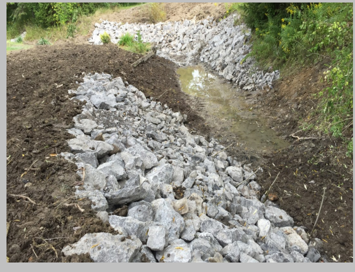
Tributary of Tonawanda Creek Streambank Stabilization in the Town of Sheldon - FEMA Project