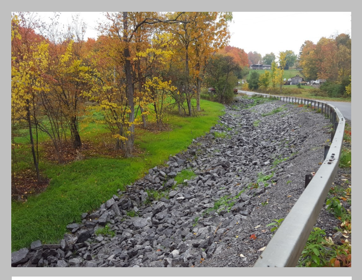
Merkle Road Streambank Stabilization in the Town of Attica - FEMA Project