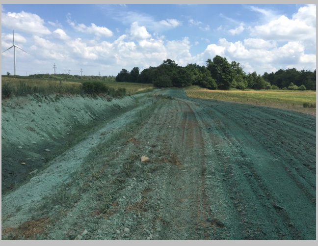
Hydroseeding at Fugle Dairy Farm