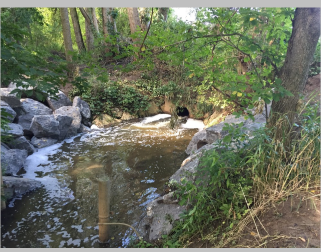
Attica WWTP Stream Stabilization - After