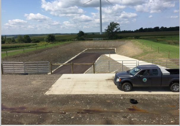
AEM Award - Fugle Dairy Farm, Strykersville, NY