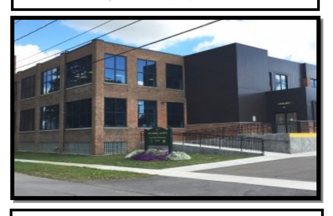
Wyoming County Agriculture & Business Center

Our Address: 36 Center Street Warsaw, NY 14569 Telephone/Fax: (585) 786-3675