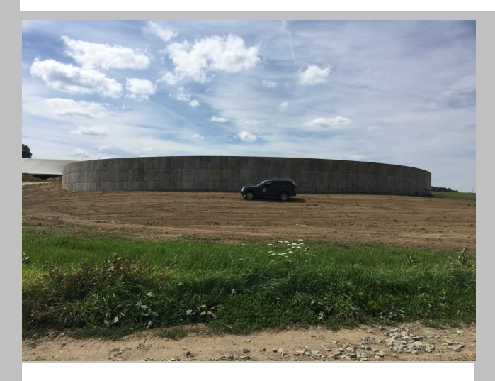
Woodvale Farms — Waste Storage