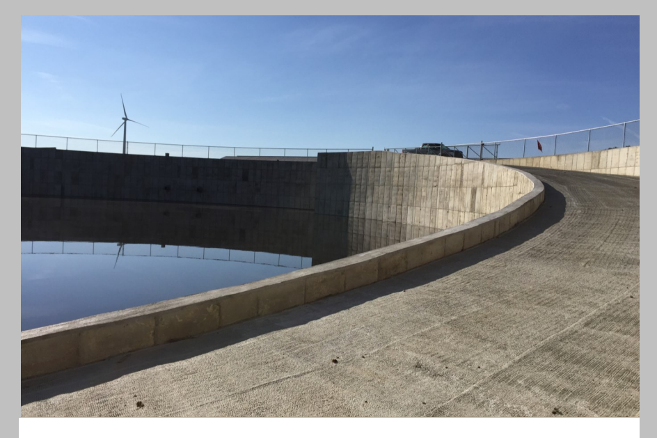
Construction of Waste Storage at Davis Valley Farm, LLC