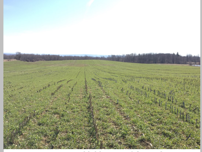
Pankow Farms — 182.00 acres of Cover Cropping