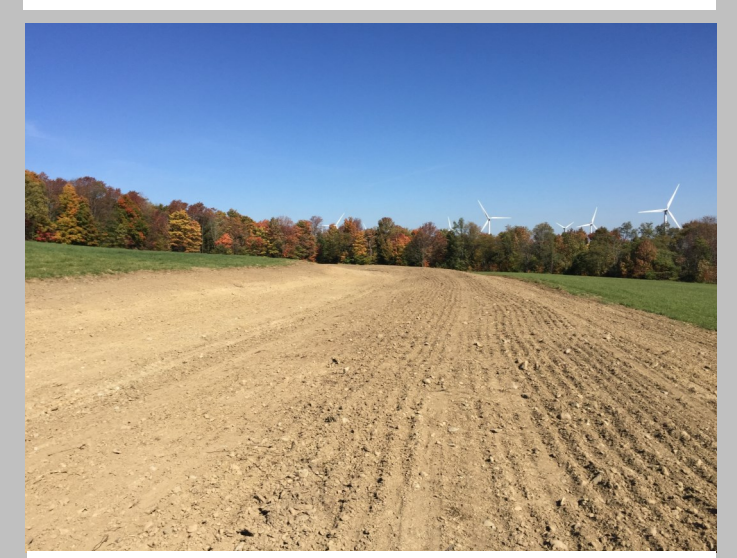
Wilmar Farm — Diversion Ditches