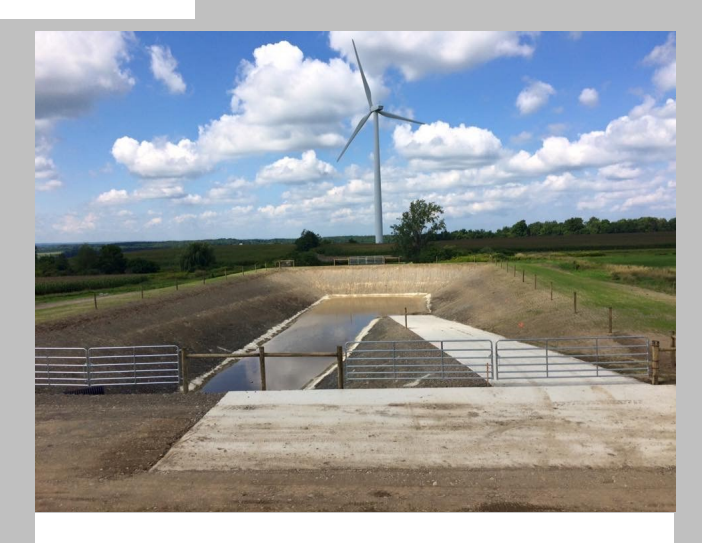
Fugle Dairy Farm — Waste Storage