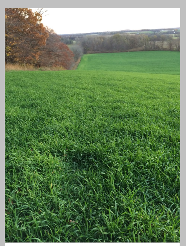
Armson Farms, LLC — Cover Cropping