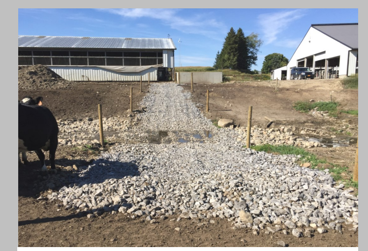
Stoney Creek Farm, LLC Cattle Crossings/Livestock Exclusion Fencing