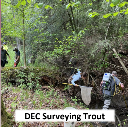
DEC Surveying Trout

Wyoming County SWCD has provided assistance to the Buffalo - Niagara Waterkeeper, U.S. Fish and Wildlife, and Trout Unlimited in the implementation of a new culvert on Crow Creek in order to restore trout habitat connectivity. Prior to construction, trout were surveyed via electroshocking both upstream and downstream of the current culvert and moved downstream of the construction area. 74 adult trout were found downstream, while only 4 were found upstream of the current culvert— proving the need for better connectivity. A 14 ft steel culvert was installed in addition to 7 LUNKERS (trout habitat structures) and grade control structures, while re-aligning the stream properly. Overall, this project was a collaborative success amongst various environmental agencies, the Town of Orangeville, and the Wyoming County Highway Department.