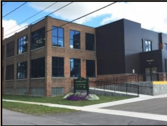
Wyoming County Agriculture & Business Center

If you would like to receive your conservation news by email rather than hard copy, please email Wyoming County Soil & Water Conservation District at: wcsxcd@frontiernet.net Thank You!