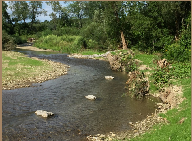
Clear Creek Stabilization Project— Post Construction