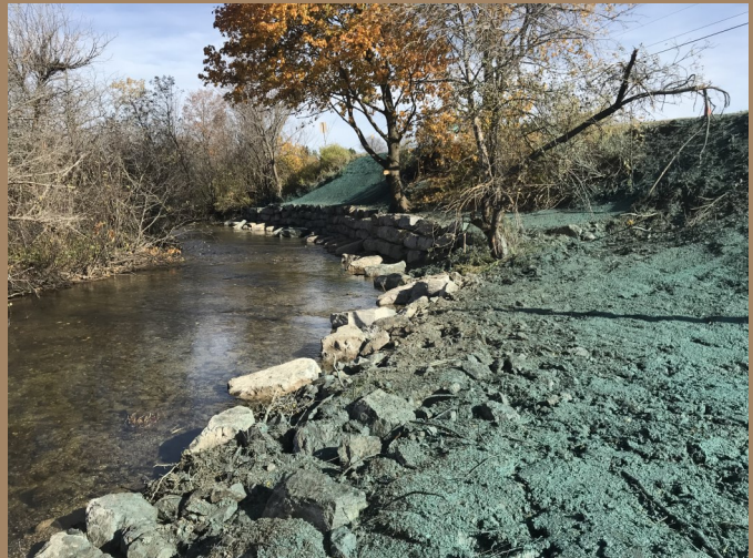
East Koy Creek Streambank Stabilization at Shearing Road, Town of Gainesville