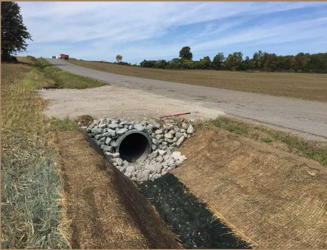
Jones Road Roadside Ditch Stabilization in the Town of Warsaw