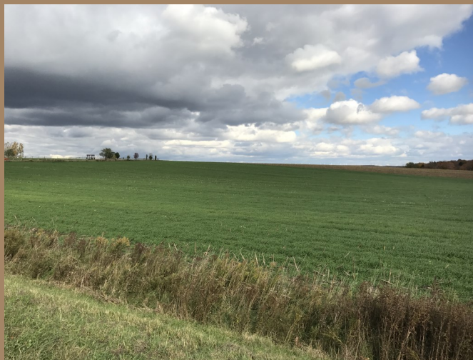
Cover Cropping completed in the Cattaraugus Creek Watershed