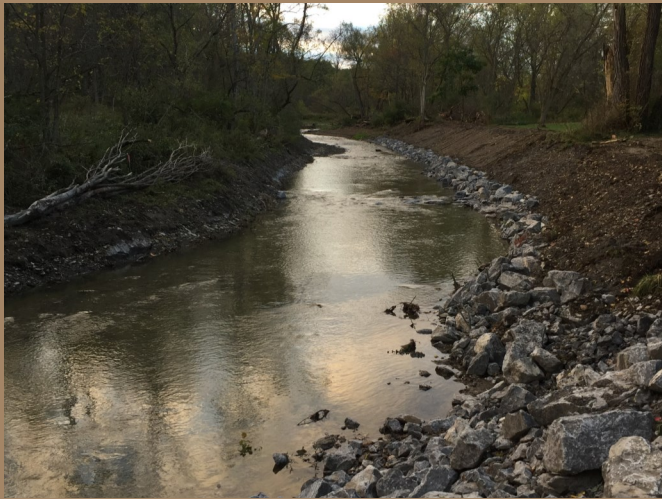
Oatka Creek Streambank Stabilization at Martinville Road, Town of Warsaw