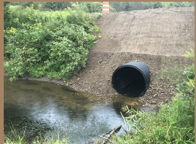
Culvert Replacement on Murphy Road in the Town of Pike