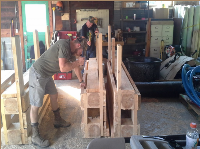
Building Lunker Boxes for trout habitat in the Oatka Creek