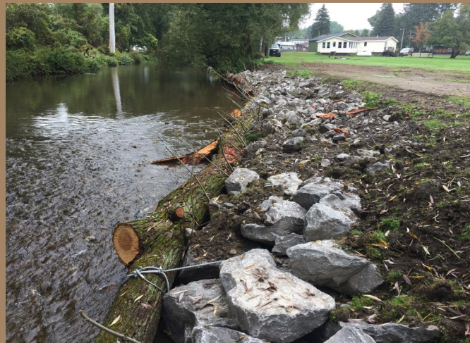
Onsite logs were used as log revetments to protect the bank on the Wiscoy Creek