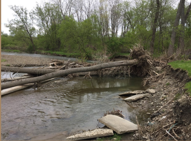
Clear Creek Stabilization Project — Before Construction