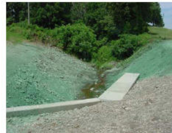
Hydroseeded bridge site at Sowerby Road in the Town of Castile.