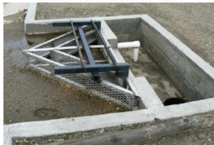
Letchworth State Park Water Supply Protection Grant Bunk Silo Leachate Collection System at Halo Farms, Town of Castile.