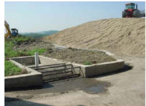
Silage leachate collection system at Old Acres Farm in the Town of Perry.