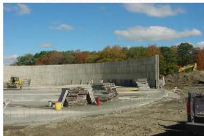
Genesee River Ag BMP Grant & EQIP Concrete Manure Storage Tank at Hi-Land Farm.