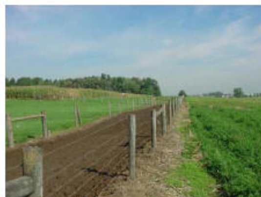
Livestock laneway constructed at Table Rock farms in Castile.