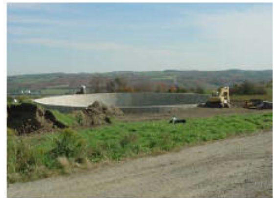
Concrete manure storage tank constructed at Hi-Land Dairy in Middlebury.

In 2006, Wyoming County received an additional $395,000 in Federal Funds for Agricultural Projects through EQIP.