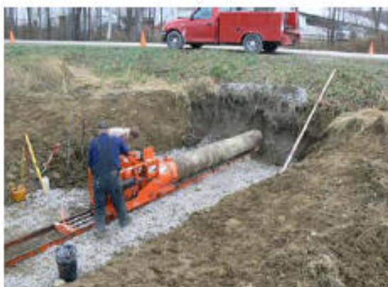
Boring under road for silage leachate transfer pipe to filter strip at Broughton Farms.