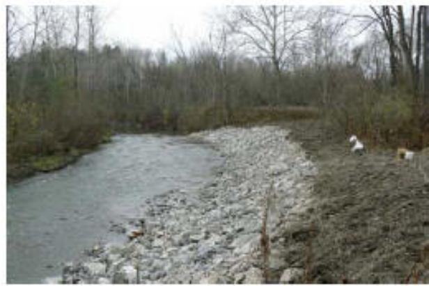
Rock streambank protection along the Buffalo Creek in the Town of Java.