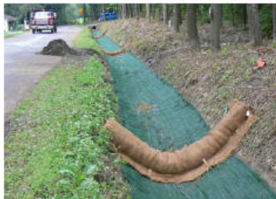
Permanent reinforcement turf with coconut fiber coir log check dams at Luther Grove Road.