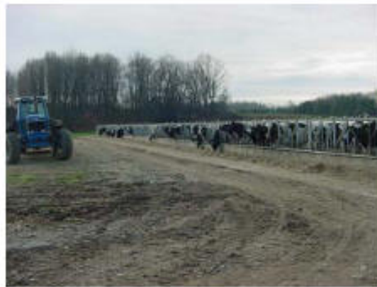
Heifer feeding facility at Ed Koerner's Farm in the Town of Pike.