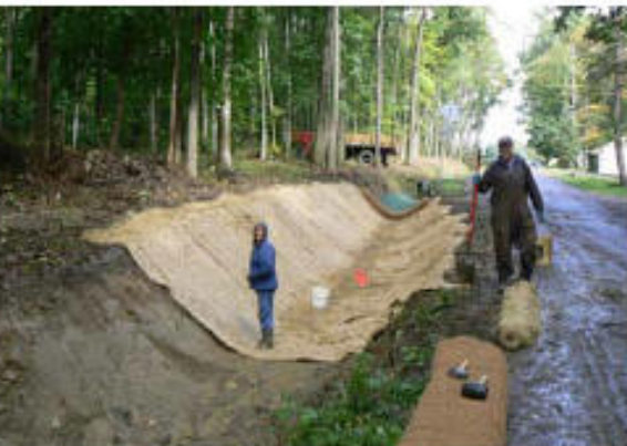
SWCD and Town Highway personnel installing straw erosion control blankets at Luther Grove Road near Silver Lake.