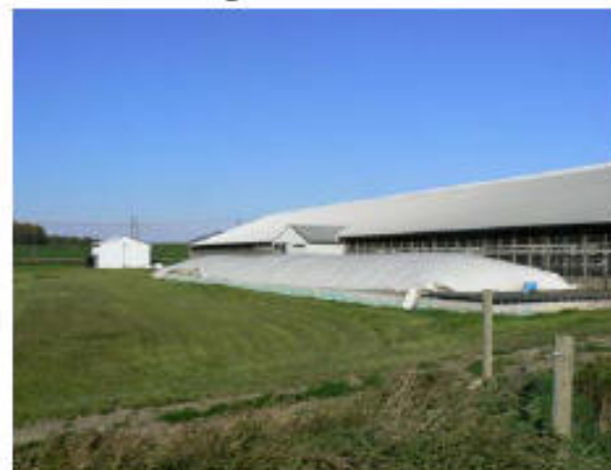
Methane Digesters - NYSERDA Grant to the Town of Perry, Sunny Knoll Farm and Emerling Farms

Cover Photos: Top Left - Concrete Manure Storage at Hi-Land Dairy, Top Right - EWP Project, Town of Orangeville, Bottom Left - Luther Grove Road, Town of Castile, Bottom Right - Silage Leachate Collection System at Halo Farms