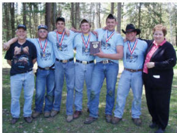
Warsaw Central School, 2006 Trailside Envirothon, Wyoming County winners.