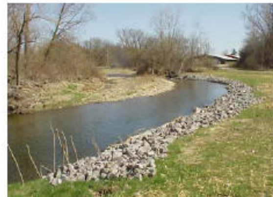
Streambank stabilization project completed on the Wiscoy Creek at the Wyoming County Fairgrounds.