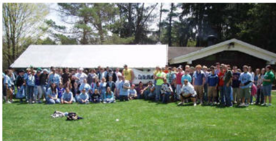
2006 Trailside Envirothon group photograph.