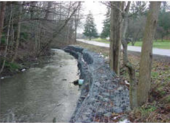
Gabion baskets installed on Brown Brook to protect Michigan Road in the Town of Java.