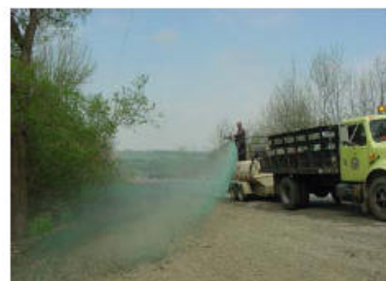
Hydroseeding along Centerline Road in the Town of Sheldon.