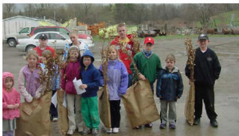
4-Her's receive tree and shrub packets from the District.