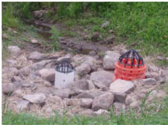
Surface inlets constructed at Dueppengiesser Dairy Company in Perry.