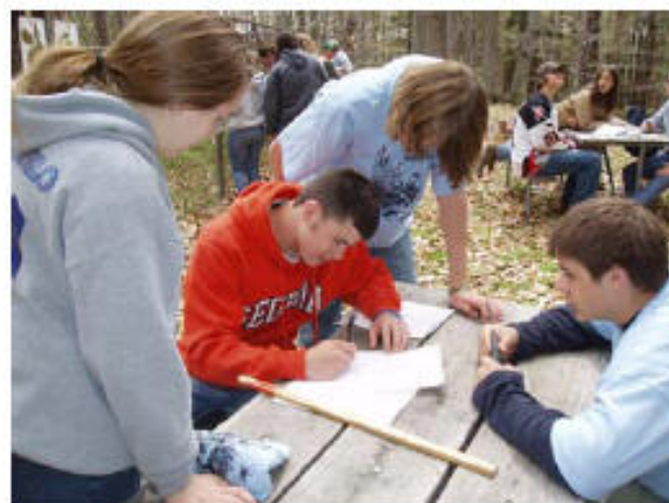
Students study Forestry at the Trailside Envirothon.